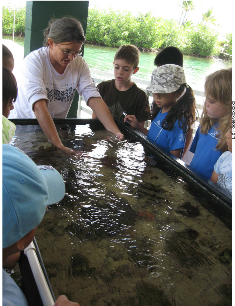
Navigating Change also brings students to Moku o Loe at the Hawai'i Institute of Marine Biology.

Maunalua Bay is only the first community to participate in Navigating Change. During the 2009-2010 school year, the program will focus its efforts in Hilo Bay on the Island of Hawai'i. To learn more, visit the Navigating Change website at www.hawaiianatolls.org .