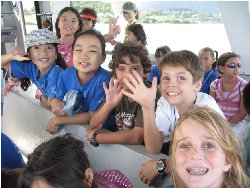
Through programs like Navigating Change, we hope to inspire the world's future leaders to take better care of the Earth's resources.